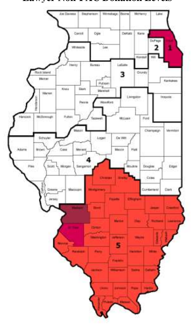
Figure 5: Map of Judicial Campaign Trial Lawyer Non-PAC Donation Levels

areas with higher donation levels. For example, the lawsuit filing rate in Madison County of 8.255 lawsuits per 1,000 residents is dramatically higher than the 1.239 lawsuits per thousand average of the 64 counties in the Second, Third and Fourth Judicial Districts. While per capita lawsuit filings were more than 6.5 times greater in Madison County, per capita donation levels were almost 73 times greater. In Cook County, the per capita filing rate is almost 3.25 times greater, while the per capita donation level is 59 times greater.